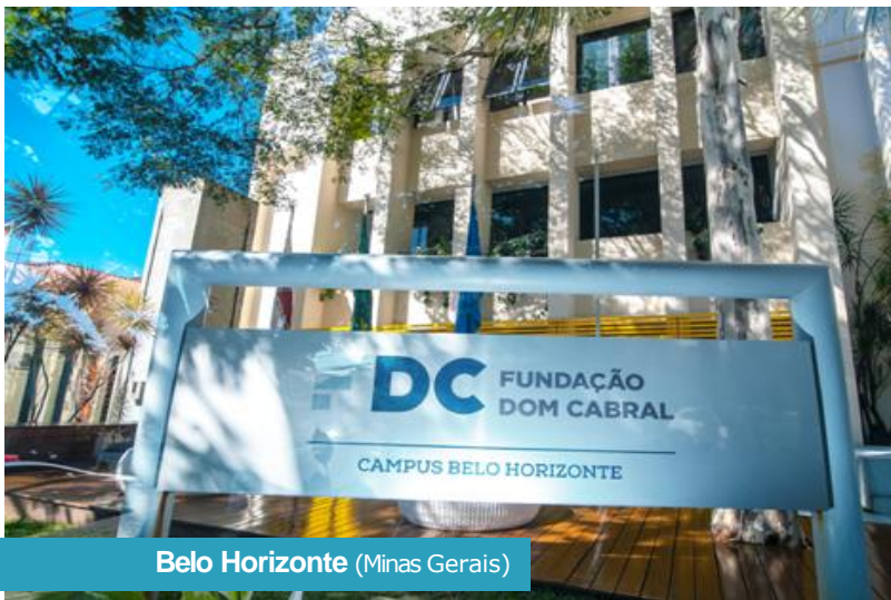
Belo Horizonte (Minas Gerais)