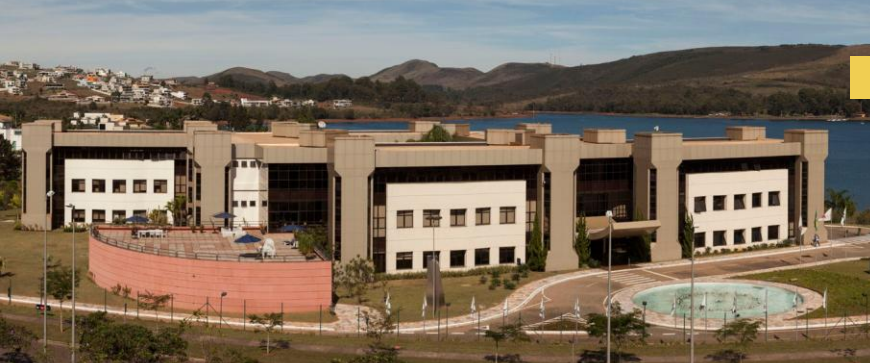
Aloysio Faria Campus (Minas Gerais)

FDC has 03 Campuses in Brazil: two in the state of Minas Gerais and one in the state of São Paulo.