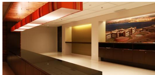
Vila Olímpia (São Paulo)